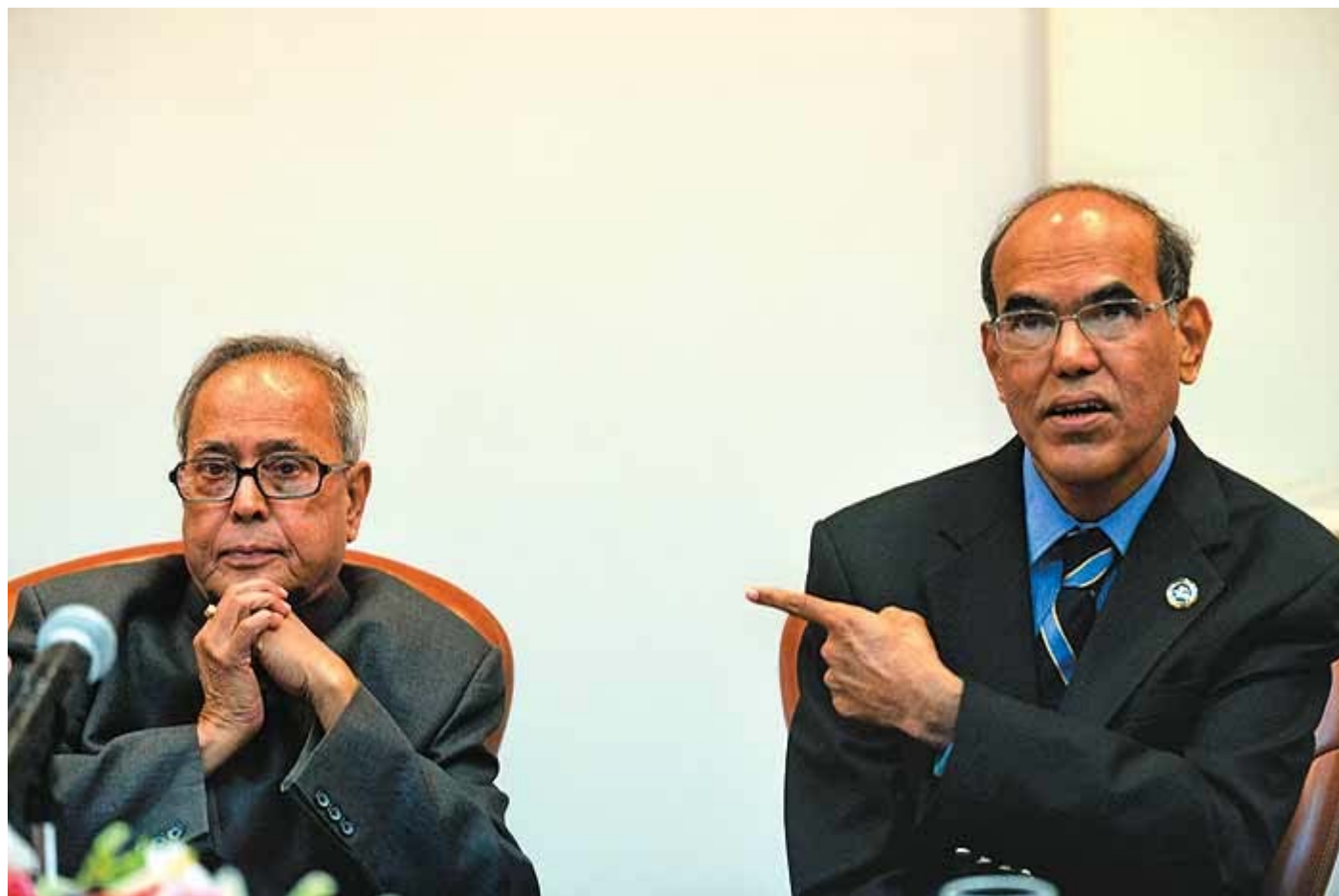
Pointing Fingers Union finance minister Pranab Mukherjee is at loggerheads with Reserve Bank governor D. Subbarao (right)